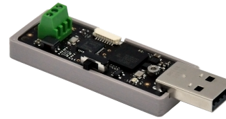
FC612 USB 100BASE-T1 Stick Raw