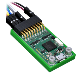
FC401 USB SMI/SPI Adapter